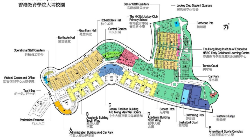
The Hong Kong Institute of Education Tai Po Campus 香港教育學院大埔校園